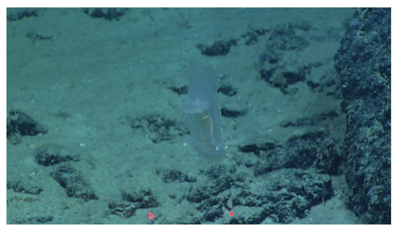
Holuthorian observed near the seafloor, swimming into the water column. Transparent in color, digestive system seen through tissue.