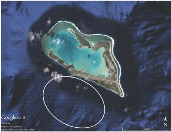
Overall map of the Hayate site.