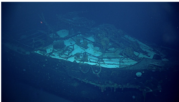
Bow of the Amakasu Maru.