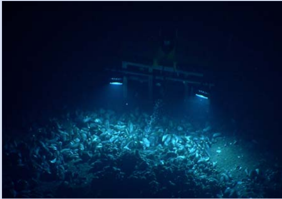
A view from the Seirios camera of Little Herc over top of an extensive bed of living and dead mussels where we were to conduct the gas capture experiment.