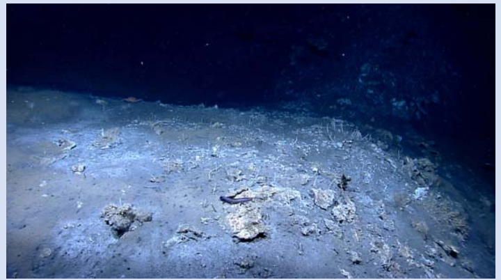
The complex topography around WP2 consisted of many ridges and enclosed depressions, perhaps formed by collapse following dissolution of underlying methane hydrate deposits.