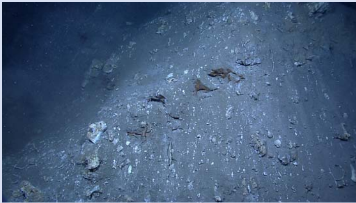
A slope of unstable-looking sediment near the WP2/Seep 4 area. Outcroppings of yellow methane hydrate are visible.