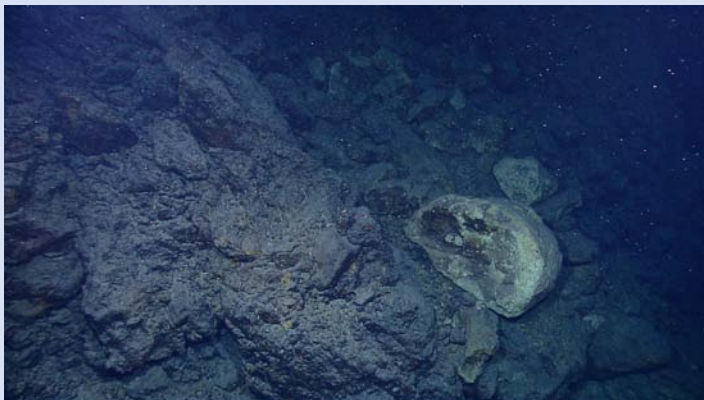
Hydrothermal rubble on the side of the main vent at Von Damm hydrothermal vent site