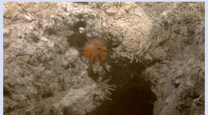
The rare small hydrozoan siphonophore from the family Rhopalidae held in position by fine tissue next to the burrow of an unknown animal