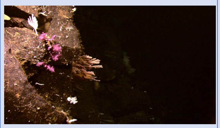
20100706_04h40m08s20_ROVHD_ROCKS_CORAL The pilots traversed the ROV up a steep face of rock that was lightly covered in fine-grained pelagic sediment and contained several different species of corals, sponges and crinoids.