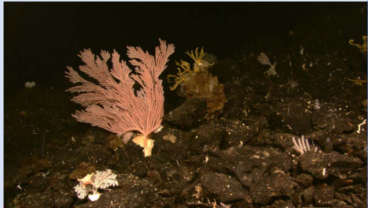
20100706_05h29m07sII_ROVHD_CORAL_ZOOM Biomass appeared to increase as we approached the summit ridge and was mostly dominated by sessile species