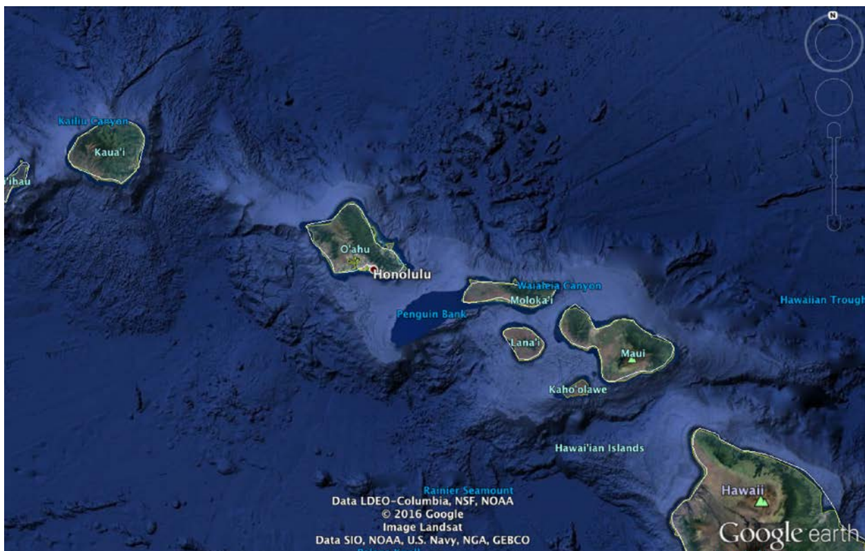
Figure 1: This figure shows the primary operating area of the Okeanos Explorer for EX-16-08. Image created with Google Earth Pro.

The ship will conduct 24 hour operations consisting of daytime ROV dives, with ship shakedown items and evening/nighttime mapping operations and DP testing. During this cruise, we are planning on conducting one 4 hour ROV dive, three 8 hour dives and one 10 hour dive. ROV operations will be conducted between 250 and 3,000 meters depth and will include high-resolution visual surveys, engineering trials, and potentially instrument recoveries. Mapping operations will be conducted in 250 m of water and deeper, and include a patch test, GAMS calibrations, engineering trials as well as overnight multibeam, water column backscatter, and sub-bottom data collection.