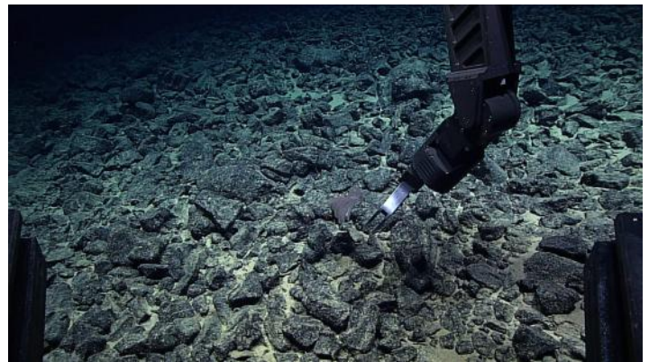
Collecting of a potential Schizopathes sp at the end of the dive. If the field identification is correct, this is either a new record or new species for Hawaii.