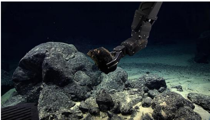
Collection of a vespicular basalt sample from the crest of the ridge at the beginning of the dive. The expected thick Mn crusting was not observed at this site.